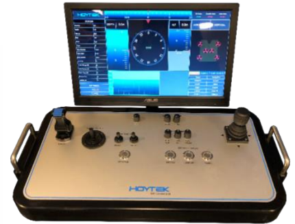
High Tech Industrial Controller