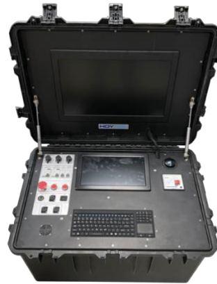
Industrial Control Case