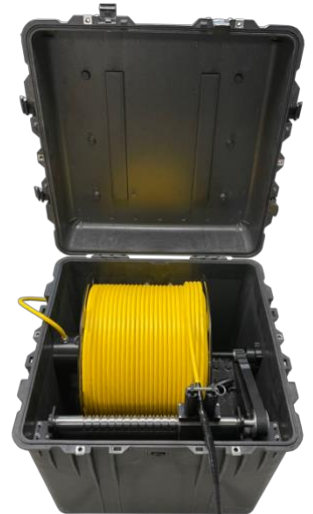
Tether Case with Levelwinder